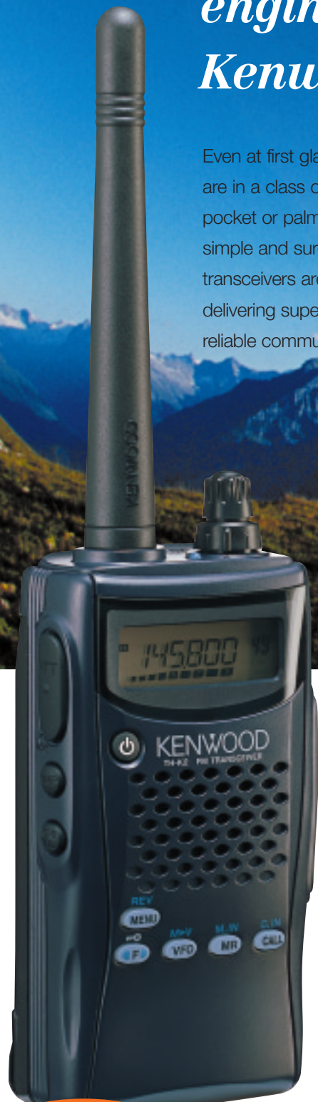
Actual size TH-K2E