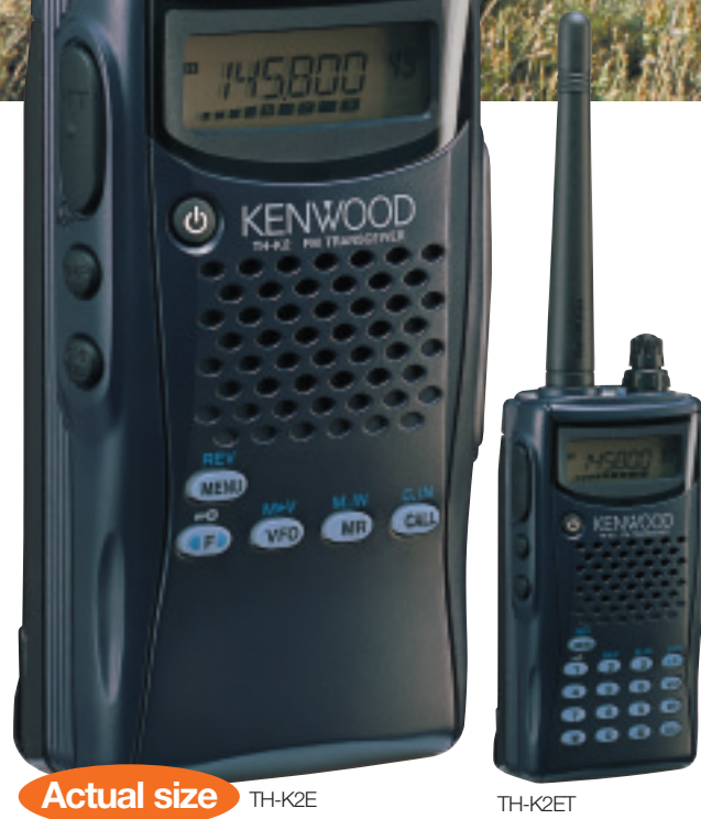
Actual size TH-K2E