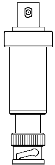
ABF125 shown to scale

The ABF125 is not an amplifier so will not 'boost' signals, however the additional selectivity offered can significantly improve reception in many situations by removing unwanted strong signals which may overload the receiver and reduce it's effectiveness. When any connection is fitted to the aerial signal path some reduction of signal is resulted (attenuation) however the ABF125 in band attenuation level is very small due to the excellent in band V.S.W.R. of 2:1 resulting in a loss of only about 4dB.