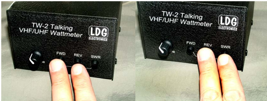
Verbose Mode "Long"