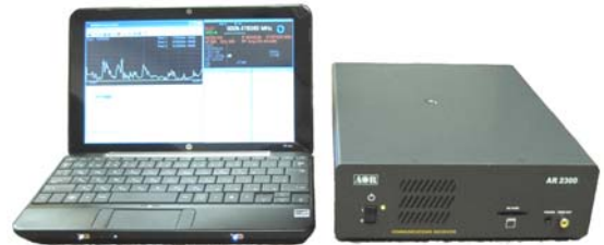
Lightweight net-book PC can be used as control head for the AR2300. (PC not included.)

All functions of the AR2300 can be used with a lap-top or desktop PC that runs under Windows XP or higher OS. The AR2300 can be controlled remotely through an optional LAN controller.